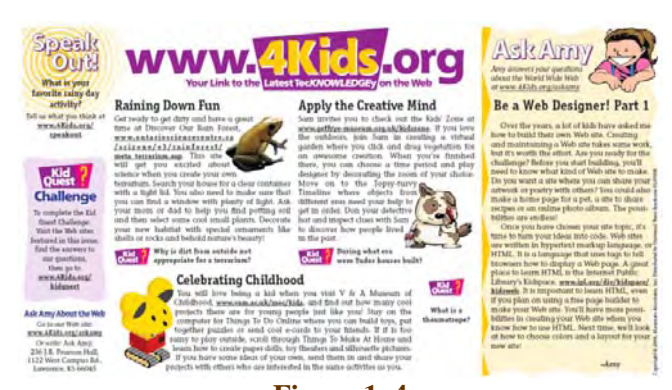
Figure 1. 4 Kids.org as it appears in weekly print syndicated publications.

Since its inception in 1995, 4Kids.org has appeared in more than 500 weekly issues published in newspapers worldwide to promote use of the Internet and technology literacy. The database containing these website selections and reviews can be accessed online at <a href="http://4kids.org/">http://4kids.org/</a> in the "Back Issues" section. Every week, 4Kids.org features three websites carefully chosen by staff members. Sites are reviewed and selected for inclusion in the publication if determined to be educational, kid-friendly, and free of advertisements. Many of the featured sites are interactive and encourage learning through games, quizzes and online research activities.