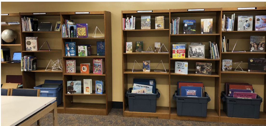
Figure 3: Theses same CRC shelves after the work of the elementary education class

Fortunately, an alternative solution was developed in the form of book displays by theme which could incorporate both picture and juvenile books together on the same shelf, along with appropriate K-12 non-fiction titles. The elementary education students used additional shelving which was standing empty in another part of the CRC, shown in Figure 2. They developed several book displays, including an Earth Day display, award winning picture books, award winning chapter books, Spanish-language books, and art, history, and science related book displays. Displays were also made for large-print “big books” designed for reading to preschool, kindergarten, and first graders. These displays shown in Figure 3 were a great success and the students were pleased with them as an alternative solution to re-cataloging and re-processing the collections.