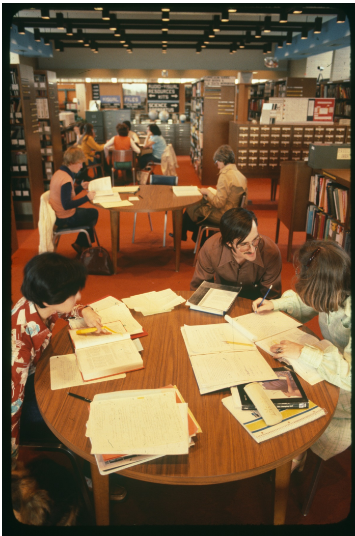
Note. In the 1970s and 1980s, the CRC was a robust and active place in which pre-service teachers studied and researched

located with a card catalog and by browsing the shelves. The CRC was always open to the public, as well as to the college community.