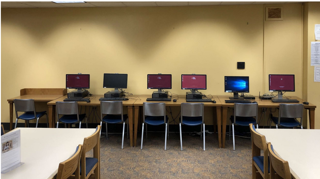
Figure 4: The computer space in the CRC prior to the work of the elementary education class

The elementary education class felt that as the purpose of the Curriculum Resource Center was to promote the teaching of children, it was important to feature artwork made by children in the space. One of the best outcomes of the collaboration between the elementary education class and the library was a mural created by third grade students from a local elementary school to decorate the empty space above the computer terminals seen in Figure 4. The elementary education faculty member introduced the elementary education students to the art teacher and technology education teacher at this school. Together, they worked with a class of third grade students who were studying the work of artists Cy Twombly and Jean-Michel Basquiat. They created a piece of artwork for the redesigned Curriculum Center, based on the graffiti-like and calligraphic styles of these artists. The artwork was created in the elementary school art classroom (see Figure 5) and was hung in the Curriculum Resource Center in the college library over a bay of computers (see Figure 6). In addition to the artwork, new computer tables and chairs were ordered to modernize the space.