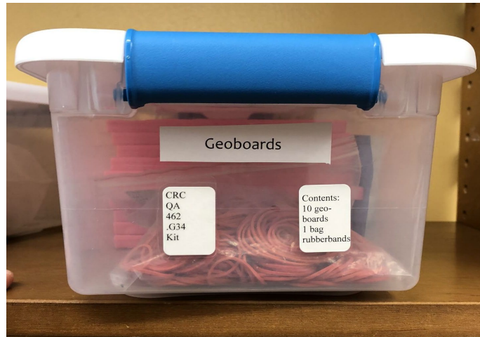
Figure 7: Example kit that was removed from a cardboard box and placed in a clear plastic bin

Additional work was also done with the Jackdaw primary source collections in the CRC. Jackdaw is a publisher of primary source materials which include historical primary source documents, as well as large photographs from historical time periods, broadsheet essays and timelines. The library has many of these themed collections which are of varying sizes from 9" x 14" to 10" x 16". They were not uniformly cataloged. Some were cataloged as kits and others as visual files or books. Circulation on all was