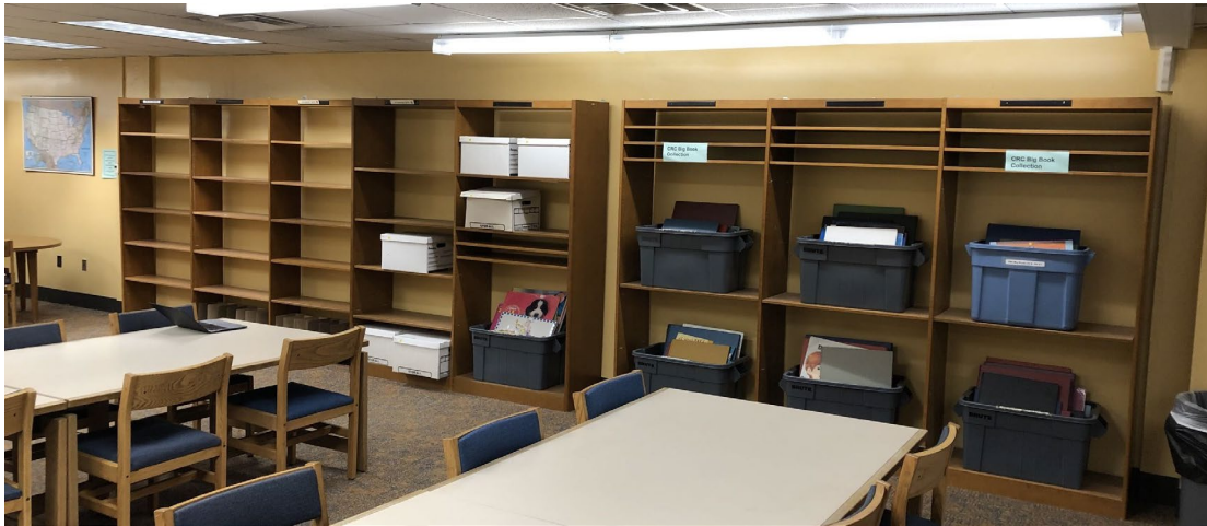
Figure 2: The empty CRC shelves prior to the work of the elementary education class

Fortunately, an alternative solution was developed in the form of book displays by theme which could incorporate both picture and juvenile books together on the same shelf, along with appropriate K-12 non-fiction titles. The elementary education students used additional shelving which was standing empty in another part of the CRC, shown in Figure 2. They developed several book displays, including an Earth Day display, award winning picture books, award winning chapter books, Spanish-language books, and art, history, and science related book displays. Displays were also made for large-print “big books” designed for reading to preschool, kindergarten, and first graders. These displays shown in Figure 3 were a great success and the students were pleased with them as an alternative solution to re-cataloging and re-processing the collections.